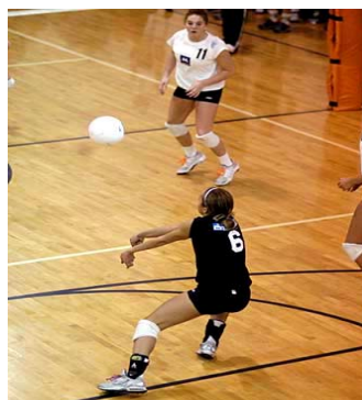
The libero will wear a different-colored jersey.

( Archbishop McNicholas High School Head Coach) suggested she check out the club. I was asked last year to join the Board taking care of registration and nkjv.net . I am very excited about my new duties. I hope that you will see this as a added way to find out what is going on in and around the club. I look forward to any news, comments, stories you have.